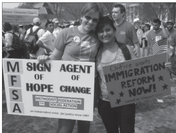
MFSA's Young Adult OnFire chapter participants in national mobilization for Comprehensive Immigration Reform.

** When joining MFSA, you automatically become a chapter member. A portion of your MFSA dues is returned to your annual conference MFSA chapter (or to help organize new chapters). All members receive the bi-monthly Social Questions Bulletin for free. No one is denied membership for lack of funds. Membership gifts to MFSA are tax deductible as provided by law.