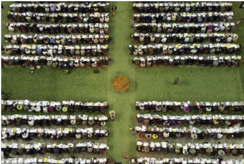
Delegates gathered in Fort Worth, Texas, in 2008 for General Conference.